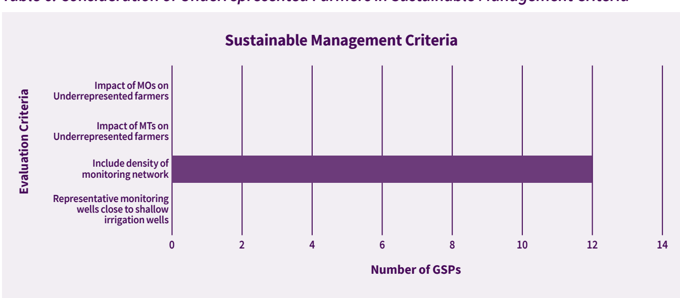
Table 6: Consideration of Underrepresented Farmers in Sustainable Management Criteria

None of the reviewed GSPs considered the impacts of their minimum thresholds and measurable objectives on Underrepresented farmers ( Table 6 ). While 12 of the plans included a density map of their monitoring network, all plans failed to include representative monitoring wells close to shallow irrigation wells. Having representative monitoring networks in close proximity to shallow irrigation wells is important to adequately monitor and understand groundwater level changes near shallow irrigation wells dependent on shallow aquifers.