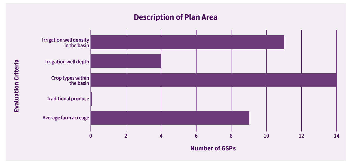
Table 3: Consideration of Underrepresented Farmers in Plan Area