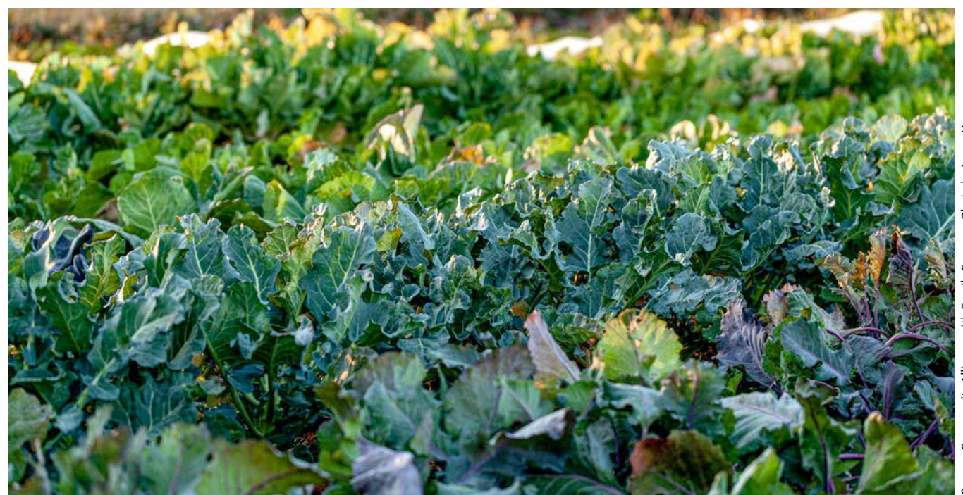
ource: Community Alliance with Family Farmers.