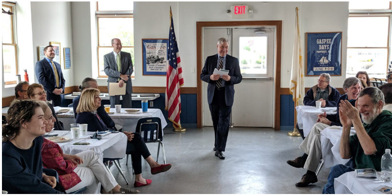
▲ U.S. Senator Sheldon Whitehouse.