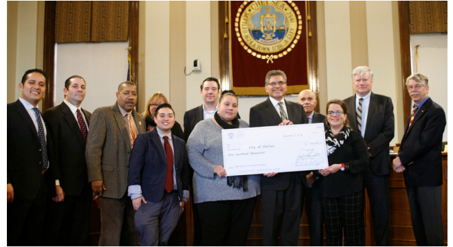
▲ Surrounded by Chelsea officials, Massachusetts Water Resources Authority (MWRA) staff and Clean Water staff, GreenRoots and Chelsea City leaders hold a model $100,000 check from the MWRA to the City to finance the first year of lead service line replacement.

June will mark the beginning of a bilingual youth-led community canvass that will educate Chelsea residents about lead in drinking water, teach residents how to check their homes for a lead service line, and ultimately create a comprehensive inventory that will guide the city's replacement program moving forward. Because of this first year success, the City has committed to tripling its spending on lead service line replacement this coming year — expediting our goal of total lead service line replacement.