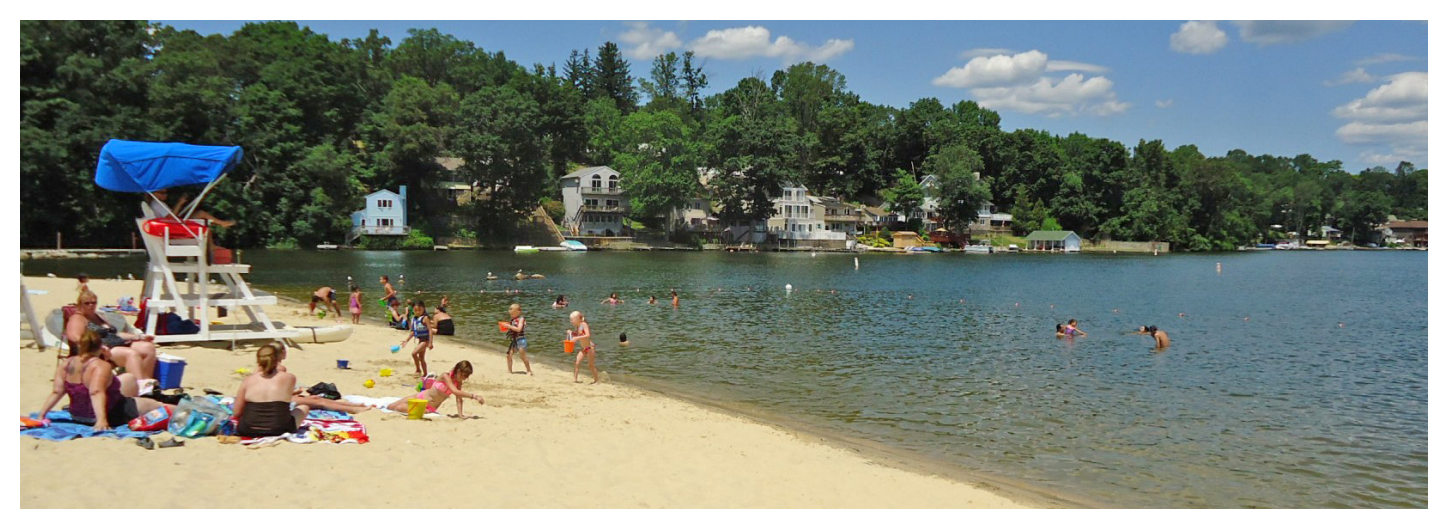
Beach at Lake Hopatcong. New Jersey closed Lake Hopatcong after the state Department of Environmental Protection detected a toxic bacteria caused in part by one of the warmest springs in the past century.

Clean Water Action, allies and supporters will continue to demand a strong clean energy plan and rapid implementation to avert climate catastrophe. We need an immediate moratorium on ALL new fossil fuel projects and aggressive cuts to existing sources of pollution, with a priority on reducing pollution in our most overburdened communities. Get involved — locally or at the state level. View the Empower NJ report, campaign activities and updates at <u>www.cleanwateraction.org/empowernj</u>