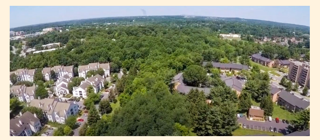
The forested greenspace in Montgomery Village and Gaithersburg shown above will be <u>paved over</u> if the M-83 highway is constructed.

Saying NO to the M-83: M-83 is a proposed highway in Montgomery County that would cut through parkland, forests, and streams. With local partners, we are asking Montgomery County to remove this relic of the mid-1900s from modern plans.